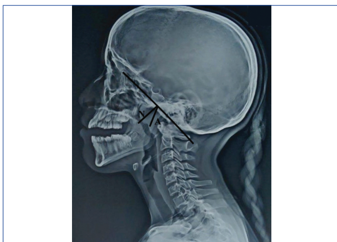
[Table/Fig-5]: X-ray neck soft-tissue lateral view.