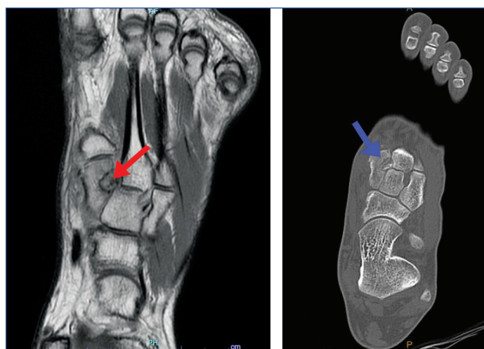
[Table/Fig-1]: Initial T1 weighted MRI imaging identifying the lesion however not identifying the benign tumour (red arrow). [Table/Fig-2]: A well circumscribed lesion at the lateral cortex of the medial cuneiform (measuring 9x8x8 mm). (Images from left to right)

Care was taken to protect the superficial neurovascular structures if encountered (dorsal branch of the great saphenous vein, medial dorsal cutaneous nerve, deep peroneal nerve and dorsalis pedis). Blunt dissection (using an unloaded scalpel handle and Raytec