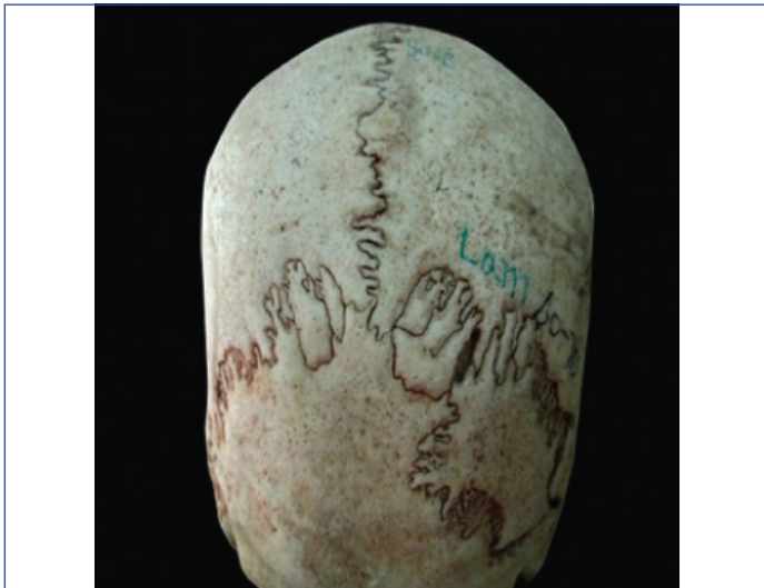
[Table/Fig-1]: Incomplete lateral asymmetric inca bone.

Among the 230 skull bones, 145 skulls were male skull bones and 85 were female skull bones. Out of the 230 skull bones examined, 6 (2.6%) skulls were seen with inca bones. Among these six skulls with inca bones five variations were noted. One skull was with incomplete lateral asymmetric inca bone [Table/Fig-1], one skull with incomplete median inca bone [Table/Fig-2], one skull with asymmetric tripartite inca bone [Table/Fig-3], one skull with complete tripartite inca bone [Table/Fig-4] and two skulls showed complete undivided inca bone [Table/Fig-5,6].