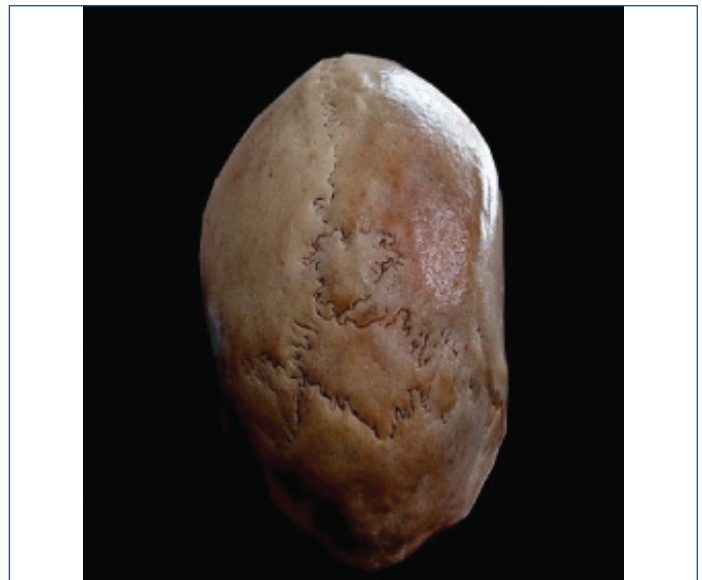
[Table/Fig-3]: Asymmetric tripartite inca bone.

The inca bones may occur because of partial or complete failure of fusion of the ossification centres of the squamous part of the occipital bone. Failure of fusion between primary and secondary centers of ossification of occipital bone leads to the formation of interparietal bone. Literature available on this inca bones suggests that occurrence of inca bone is rare [10]. Based on various studies, the incidence of the inca bones was found to be 15% in Nigerians [11], 2.4% in Indians [12]. Among modern population, the incidence of inca bone is highest among the marginal isolates, who retained their early ancestral traits [13]. As an evidence of regional continuity inca bone is characteristic of East-Asians. Such occurrence of inca bone has evolutionary, paleoanthropological, morphological and medicolegal importance. In Marathe R et al., study done in Central India, gross incidence of os incae was found to be 1.315%. This