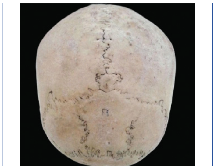
[Table/Fig-4]: Complete tripartite inca bone.