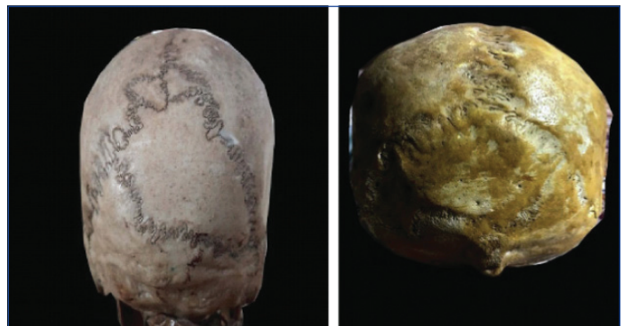
[Table/Fig-5]: Complete undivided inca bone.