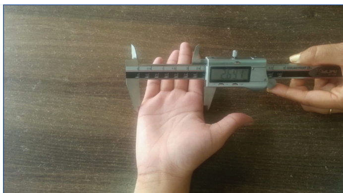
[Table/Fig-2]: Measurement of hand breadth.

Sectioning point can be used for determination of sex and it is obtained by mean values of a particular parameter. Values higher than the sectioning point usually indicate a male individual and lower values indicate a female individual [5]. Sectioning point for hand dimensions was derived by following formula [6].