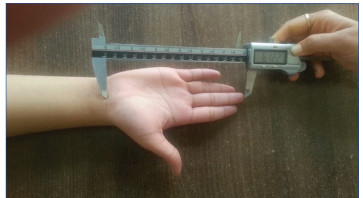
[Table/Fig-1]: Measurement of hand length.

Hand length: From distal wrist crease to distal end of the most anterior projecting point, i.e., tip of the middle finger [Table/Fig-1].