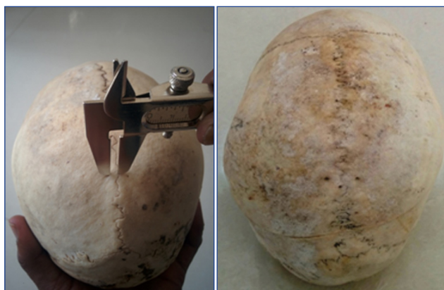
[Table/Fig-3]: Skull with bilateral parietal foramina. [Table/Fig-4]: Skull with three parietal foramina.