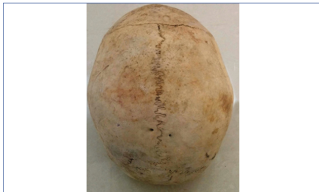
[Table/Fig-2]: Skull with unilateral parietal foramen.