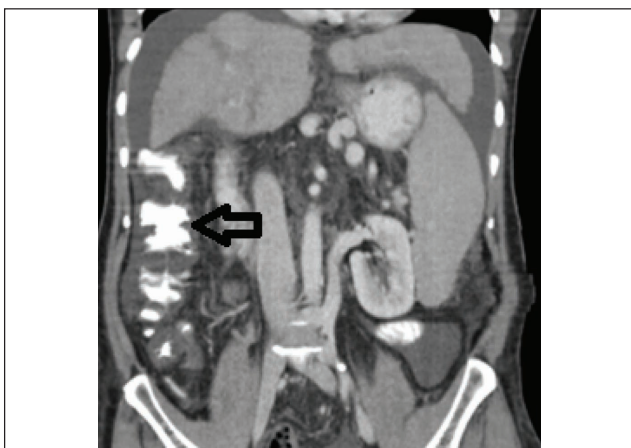
[Table/Fig-10]: CECT coronal image showing oedematous bowel wall thickening of ascending colon up to hepatic flexure.