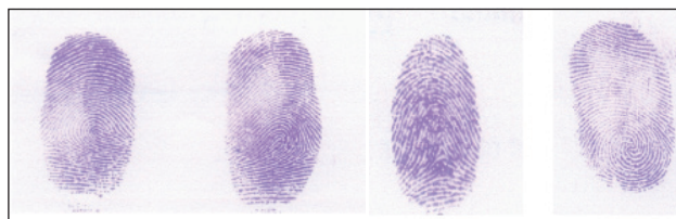
[Table/Fig-1a-d]: Types of FPPs (arch, whorl and ulnar and radial loop). a. Ulnar; b. Radial Loops; c. Arch; d. Whorl.

Evaluation of dermatoglyphic pattern: FPP of students were obtained by the ink print method by Cummin and Midlo [11]. The finger print pattern was identified with the help of a magnifying lens and classified according to the standard classification into four types i.e., arches, loops (radial and ulnar) and whorls [Table/Fig-1]. The data was recorded in