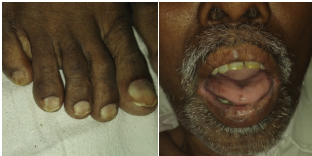
[Table/Fig-1a-b]: (a) Shows platynychia and koilonychia involving toes; (b) Shows pale oral mucosa with glossitis and pigmentation along with angular cheilitis.

On examination, the patient was thin and asthenic. He had a Body Mass Index of 14.5. He was pale and had platynychia [Table/Fig-1a]. The patient had glossitis and angular cheilitis