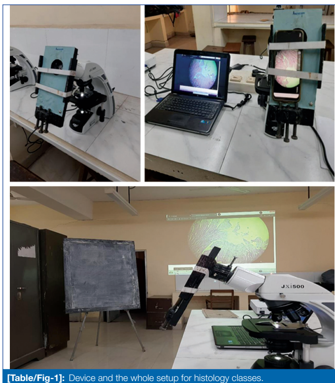
[Table/Fig-1]: Device and the whole setup for histology classes.

A total 163 number of students from the 2019-2020 batch participated in the study. Students' perceptions of online YouTube uploaded classes were assessed via the questionnaire in which students were asked to rank nine questions on a four-point scale: excellent, good, fair, and poor. The language of the questionnaire was English and 10 days were given to the students to fill up the questionnaire. Then, levels of satisfaction perceived by the students on uploaded prerecorded classes on YouTube versus live classes on Zoom or Google meet were also assessed on a three-point scale: excellent, satisfactory, and neutral.