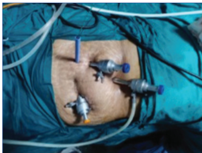
[Table/Fig-4]: Amplatz sheath in place.