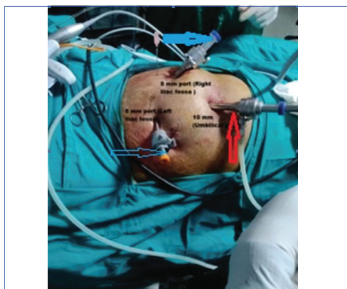
[Table/Fig-3]: Port position (Thick blue arrow- 5mm port in right iliac fossa; Thin blue arrow- 5 mm port in left iliac fossa; Red arrow- 10 mm umbilical port).