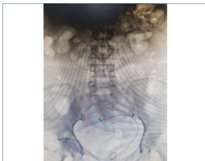
[Table/Fig-5]: Postoperative X-ray KUB.