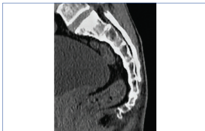
[Table/Fig-8]: Sagittal section of CT image showing retroverted tip of coccyx.