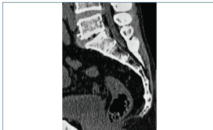
[Table/Fig-6]: Sagittal section of CT image showing sacrococcygeal and intercoccygeal fusion.

It is essential to comprehend the variations in the anatomy of the coccyx to understand the aetiology of coccydynia. The research articles have been increased in recent times with new advances in radiological