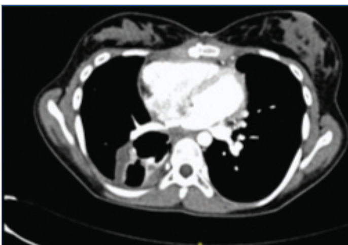
[Table/Fig-2]: Post operative CT image (mediastinal cut) showing rerouting of scimitar vein to left atrium.