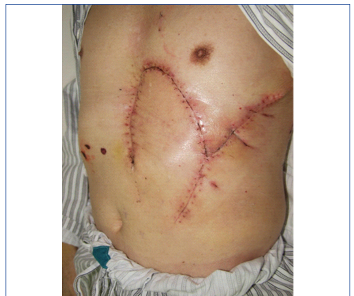
[Table/Fig-3]: Postoperative result showing well settled flap.