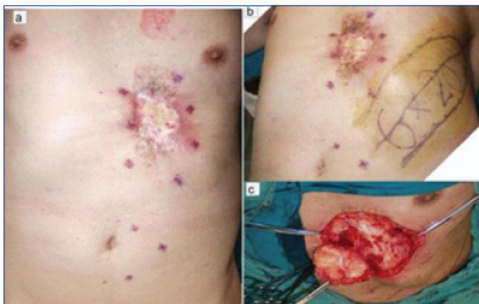
[Table/Fig-1]: a) Non-healing epigastric ulcer; b) Shows the ulcer with flap marked for reconstruction; c) Excision of the lesion.