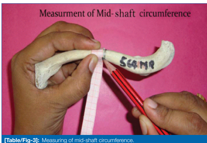
[Table/Fig-3]: Measuring of mid-shaft circumference.

In the normal distribution, the maximum and the minimum limits can be safely calculated by the formula \text{mean} \pm 3 \text{ Standard Deviation} whereas the \text{mean} + 3\text{SD} gives the maximum value and \text{mean} - 3\text{SD} gives the minimum value. In this way, we can statistically fix a measurement below which only female clavicle can be found and similarly another measurement above which only male clavicle can be seen in a particular zone. These limiting measurements were known as the Demarcating points. The data collected were analysed and subjected to statistical analysis using SPSS software version 20.0.