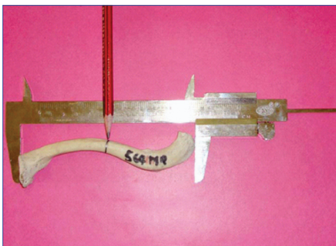
[Table/Fig-2]: Marking of mid-shaft circumference.