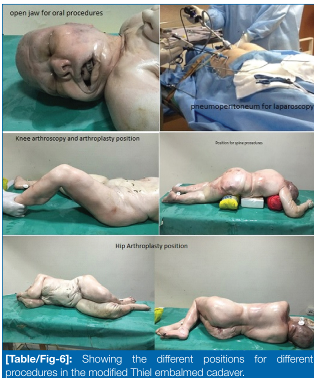
[Table/Fig-6]: Showing the different positions for different procedures in the modified Thiel embalmed cadaver.

skin, they felt the fatty layer to be altered and liquefied. Some orthopedic surgeons felt that the tissue fluid was in excess and came in the way of their procedure especially spine surgery.